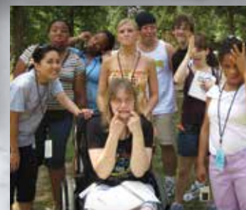
fun is priority one