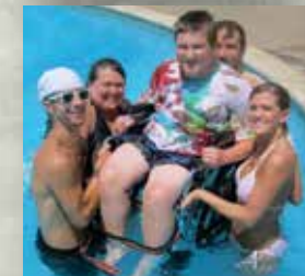
peace, love, camp looking glass!