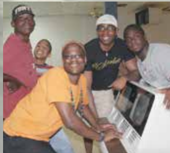
a little bowling competition never hurts

Imagine a place where all people are included, celebrated, and encouraged. For children and young adults with disabilities in the Mississippi Delta, imagination becomes a reality through Camp Looking Glass.