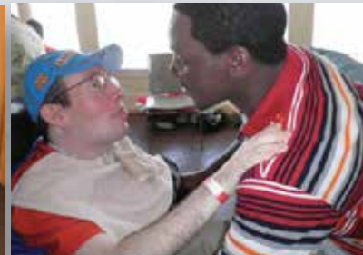
always time for a hug