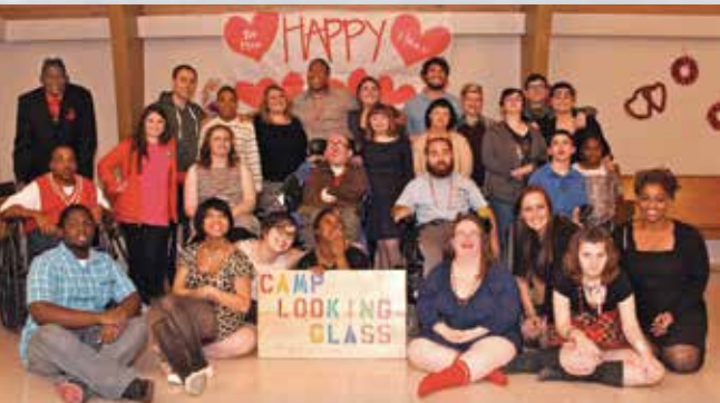
a camp full of sweethearts