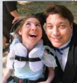
dressed for the prom