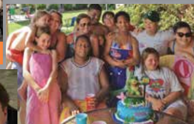
celebrating birthdays together