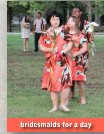
bridesmaids for a day