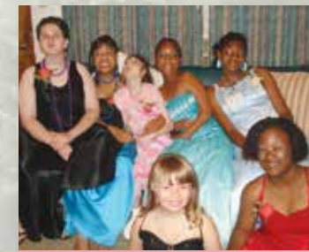
girls just wanna have fun!

We continue these activities and maintain our Camp friendships throughout the year at monthly Camp-sponsored "Art Day" meet-ups in Greenville, Mississippi, so you don't have to wait for summer to get involved!