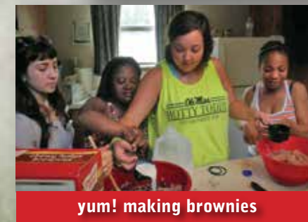
yum! making brownies