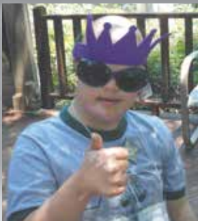
thumbs up for camp looking glass