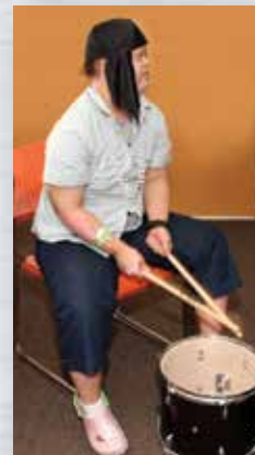
we got the beat!

...as a donor. We welcome and appreciate tax-deductible monetary donations as well as in-kind donations such as food goods, prepared meals, time and services, event space, and supplies.