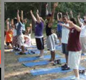
yoga class says, "ommmmm"