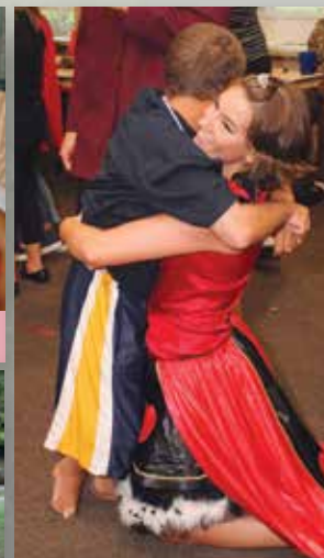
may I have this dance?